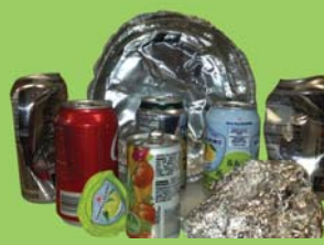
ALUMINUM CANS, FOIL & PIE PLATES