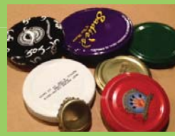
LOOSE METAL JAR LIDS AND BOTTLE CAPS