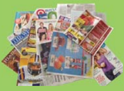
NEWSPAPERS, MAGAZINES & CATALOGS