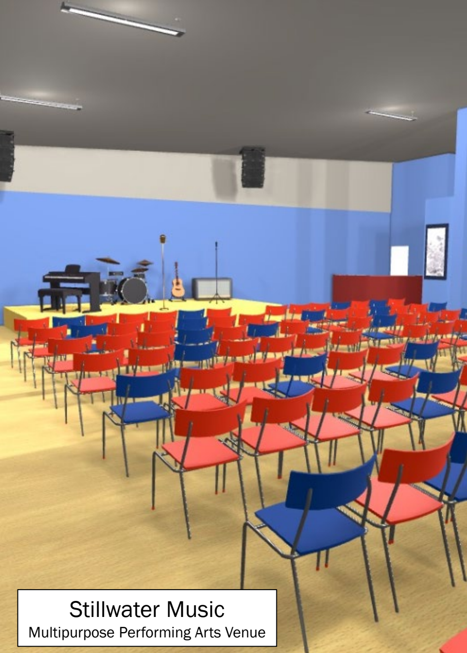
Stillwater Music Multipurpose Performing Arts Venue