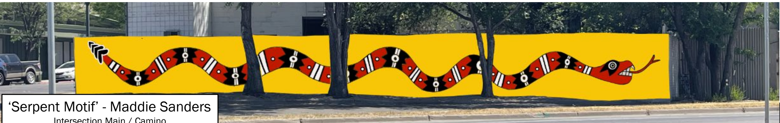
'Serpent Motif' - Maddie Sanders Intersection Main / Camino

First round of LTAC funding closes & review begins