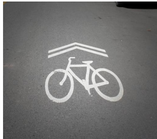
Sharrow spotted along W 2nd Ave.

This marking is placed in the travel lane to indicate where people should cycle, especially in narrower streets like Durango's.